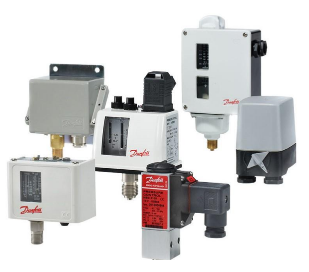
Sampling of Danfoss Industrial Pressure Switches

Understanding Pressure Switch Calibration: Calibration is the process of adjusting a device to ensure its measurements align with a standard reference. For pressure switches, this involves configuring the switch to respond accurately to variations in pressure levels. Proper calibration guarantees that the switch provides precise readings, preventing equipment damage and ensuring operational safety.